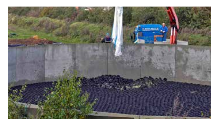
Hexa-Cover® BULK delivery and installation: