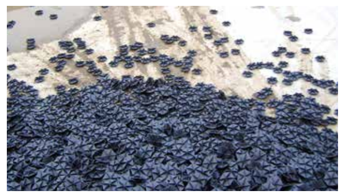
Hexa-Cover<sup>®</sup> Automatic adaption to changes in the level